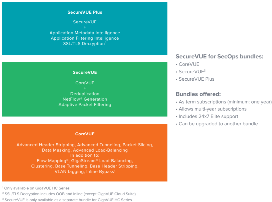
Figure 1: SecureVUE for NetOps: GigaSMART Subscription Bundles