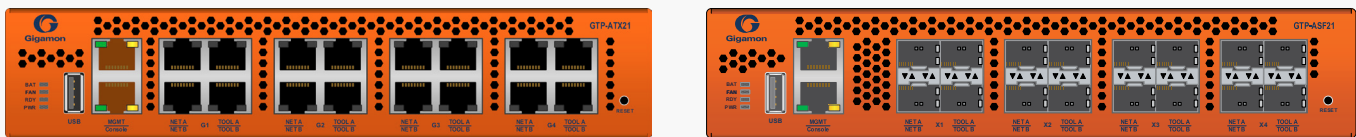
Figure 1b. G-TAP A-TX2 and G-TAP A-SF2 Front Views