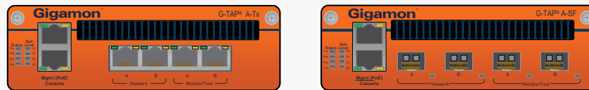
Figure 1a. G-TAP A-TX and G-TAP A-SF Front Views

Comprehensive, Flexible, High Density and Versatile Tapping for Any Copper and Mixed Media Networks